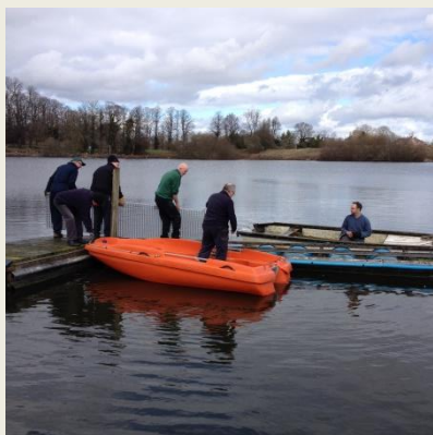
2. Hope the measurements fit !