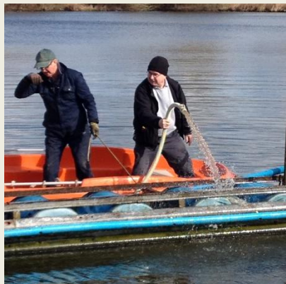
1. Hose down with Flash, boys just wanna have fun.