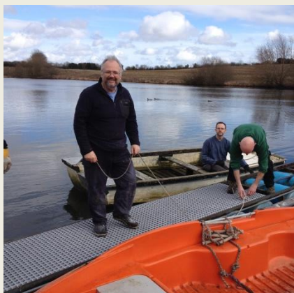
3. The Commodore and the Engineer test their design.

First work party of the season; we started recovering the right hand jetty with a super non slip , strong, grey marine covering. A do it yourself project, Gresford style.